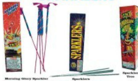
Sparkling Devices: MORNING GLORIES

CAUTION: FLAMMABLE USE ONLY UNDER CLOSE ADULT SUPERVISION. FOR OUTDOOR USE ONLY. DO NOT TOUCH HOT WOOD. HOLD IN HAND WITH ARM EXTENDED AWAY FROM BODY. KEEP BURNING END OR SPARKS AWAY FROM WEARING APPAREL OR OTHER FLAMMABLE MATERIAL. HOLD AND LIGHT ONE DEVICE AT A TIME. AFTER USE PLACE WOOD IN WATER.