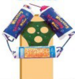
CAUTION SPINS ON POST EMITS FLAME AND SPARKS

USE ONLY UNDER CLOSE ADULT SUPERVISION. FOR OUTDOOR USE ONLY. NAIL TO POST OR STAKE SO THAT WHEEL WILL TURN FREELY. DO NOT HOLD IN HAND. LIGHT FUSE AND GET AWAY.