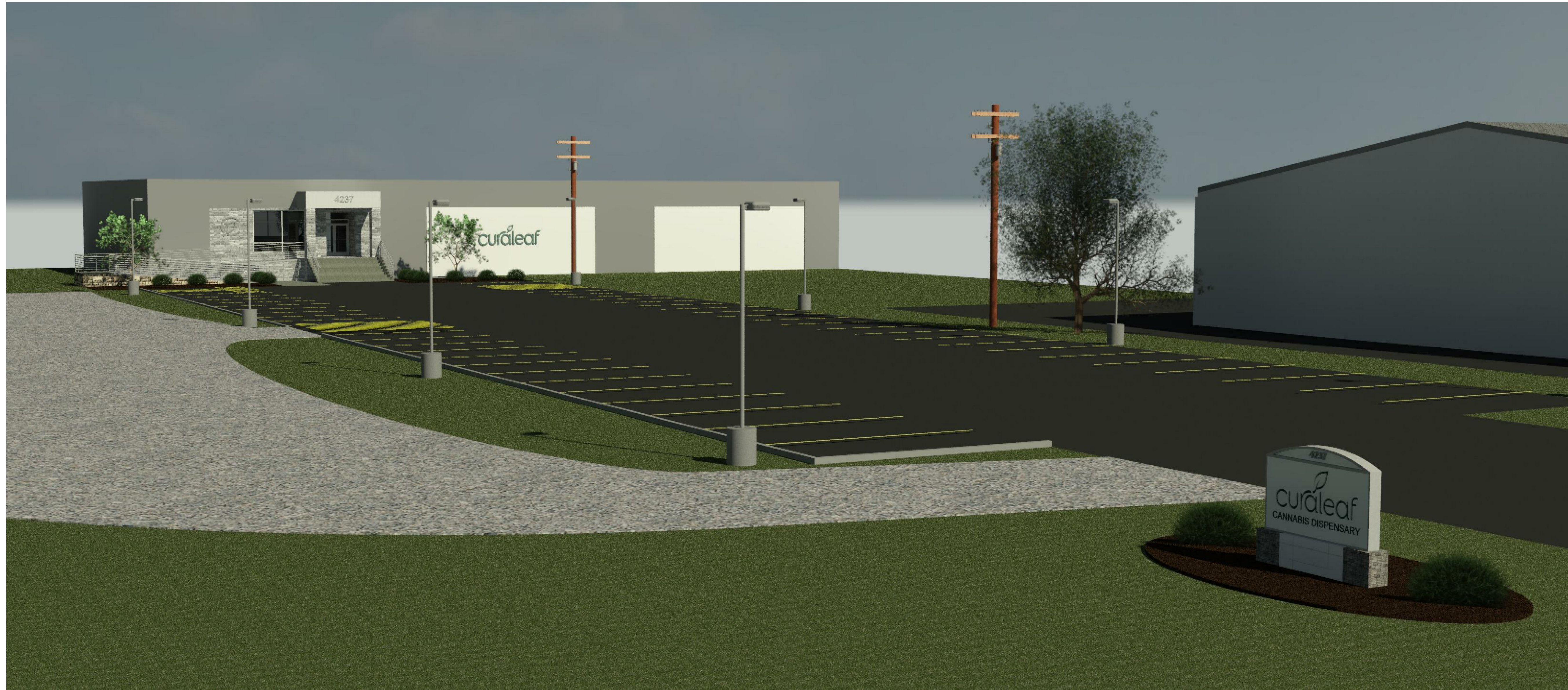
① Street View 2 12" = 1'-0"