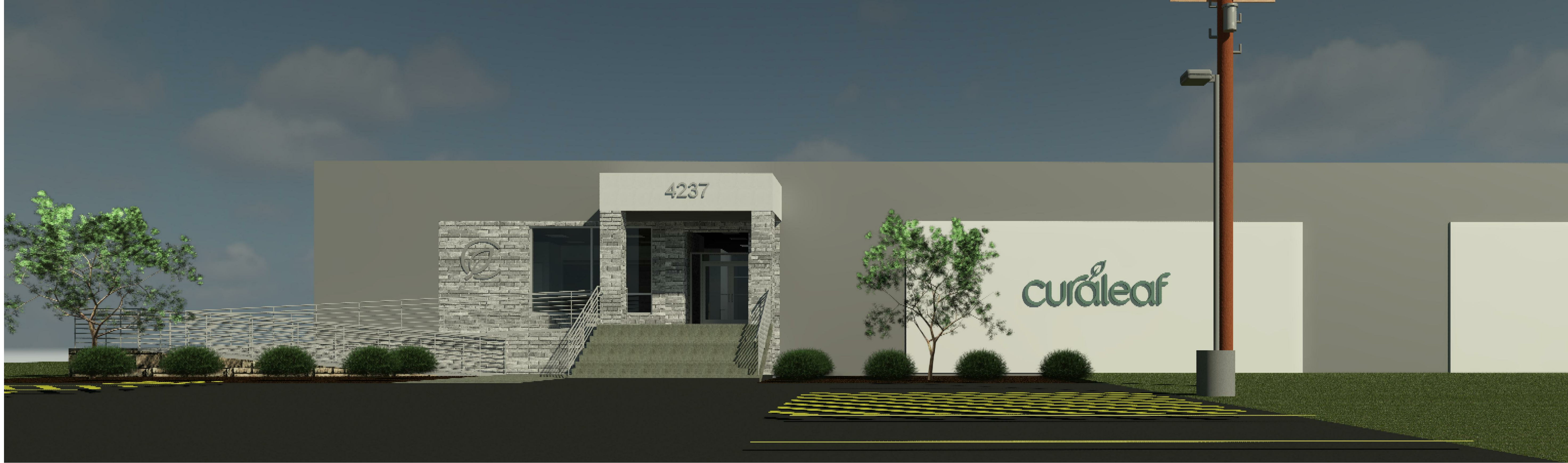
① Front Facade 1/2" = 1'-0"